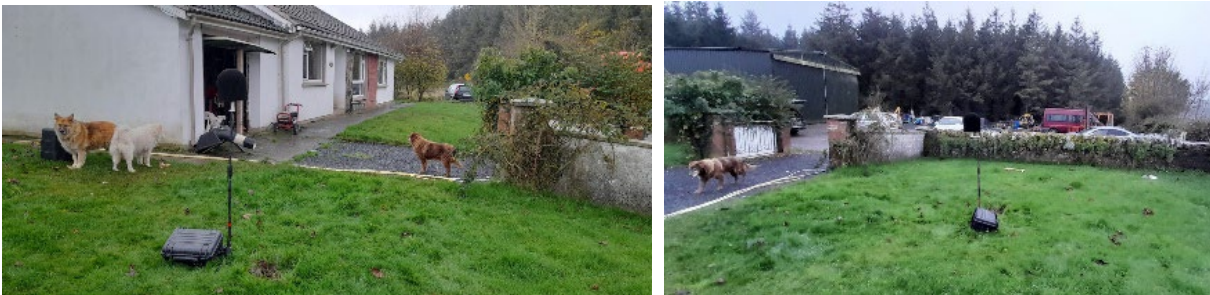
Plate A10.2-2: Monitoring Location N2

This location was located in a cul de sac and near to a wooded area, east of the site. The noise meter was located in the front garden north of the property in the direction of the site, approximately 5m from the property.