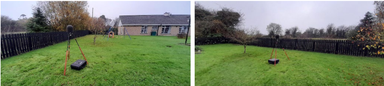
Plate A10.1-4: Monitoring Location N4

This location is in the rear garden of the property, behind a shed in the rear garden. The measurement location is approximately 18m from the rear façade of the property. There is a slight embankment along the rear boundary of the property and some hawthorn in the next field.