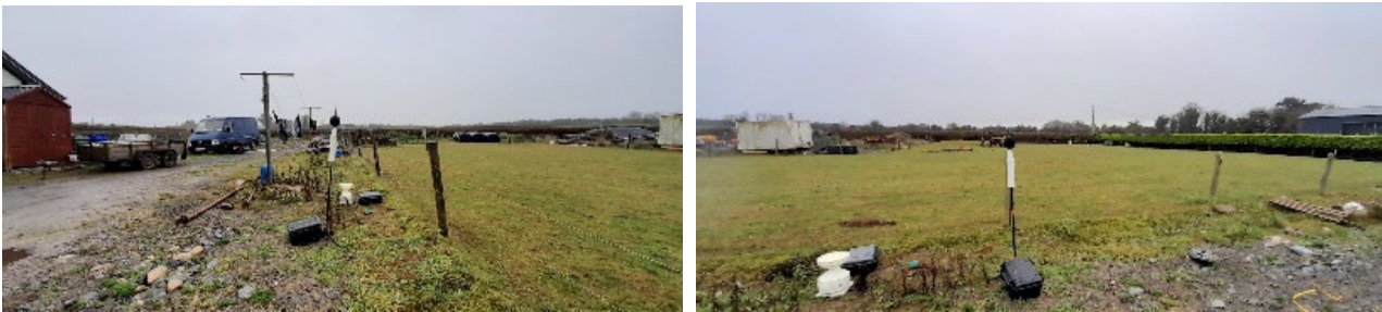
Plate A10.1-6: Monitoring Location N6

This location is on a local road off the R639 and approximately 800m from the M8 motorway. The noise monitor was located in the rear garden, approximately 13m from the property in the direction of the proposed windfarm at the quietest point in the property. The monitoring location is next to a field of sheep and also the location of the rain gauge.