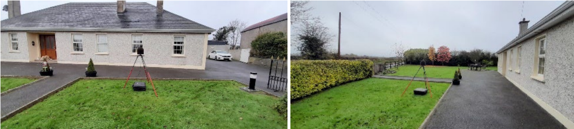
Plate A10.2-1: Monitoring Location N1

This location was to the north of the development. The noise meter was located in the front garden in the direction of the site, approximately 5m from the property facade. As there was noise from the M8 motorway to the north, the meter was located in the front garden overlooking the adjacent local road, at the quietest point in the front garden.