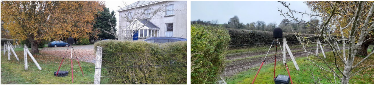
Plate A10.1-5: Monitoring Location N5