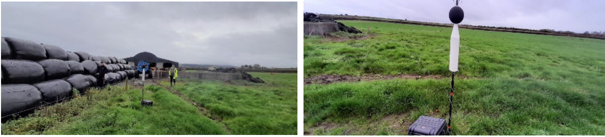
Plate A10.1-3: Monitoring Location N3